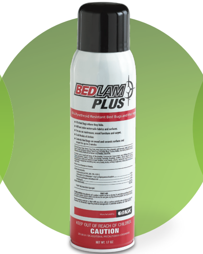
Bedlam® Plus Insecticide